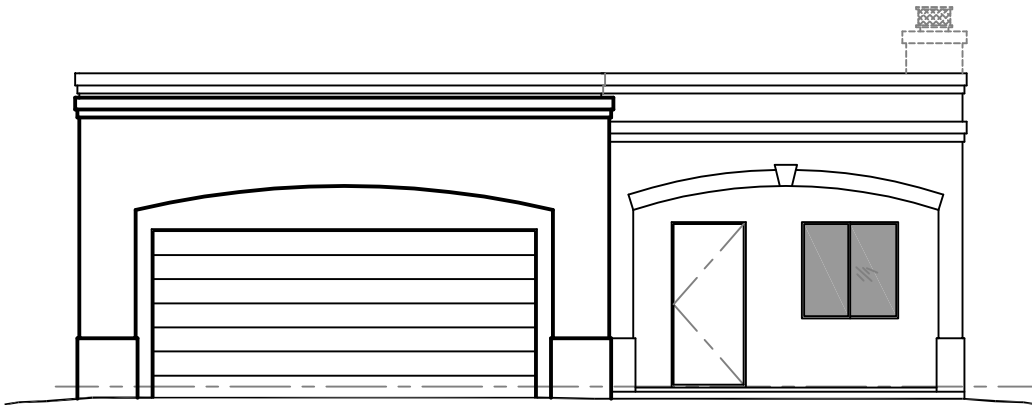
ELEVATION - B