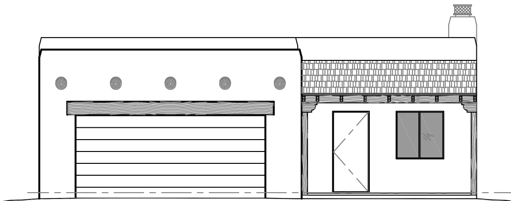
ELEVATION - C